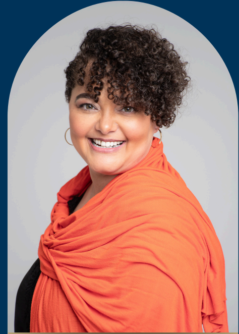
Senior Consultant Attorney